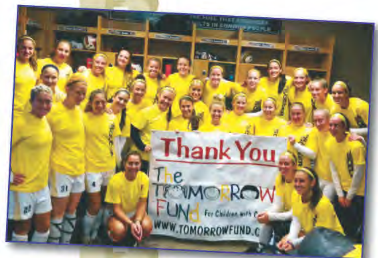
2012 Bryant University Soccer Team