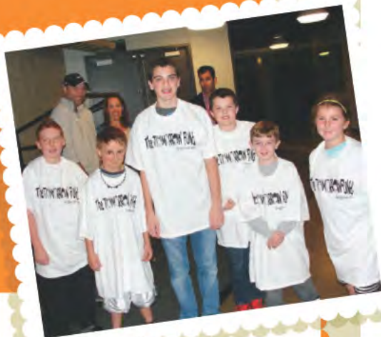
A photo collage of TTF kids and siblings before the PC Friar's basketball game.

A sports marketing group from Providence College sponsored a fundraising event on November 12, 2012. A "Tomorrow Fund Basketball Game" featuring Tomorrow Fund Kids and their siblings took place during half-time at a PC Men's Basketball game at the Dunkin' Donuts Center. The event raised over $3,200.