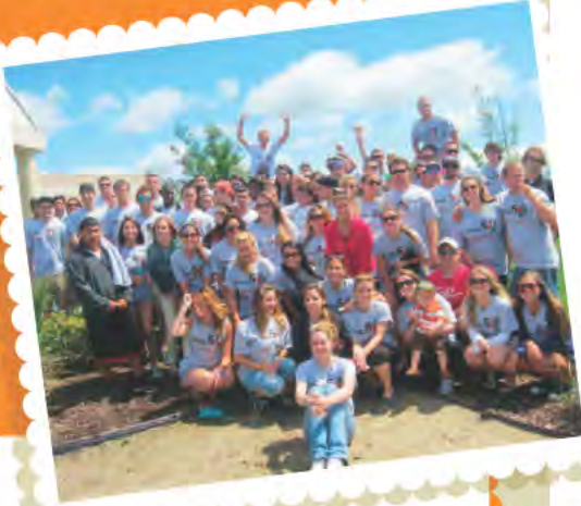
2012 Rhody 5K Belhumeur Volunteer Group, "Ever Ready"