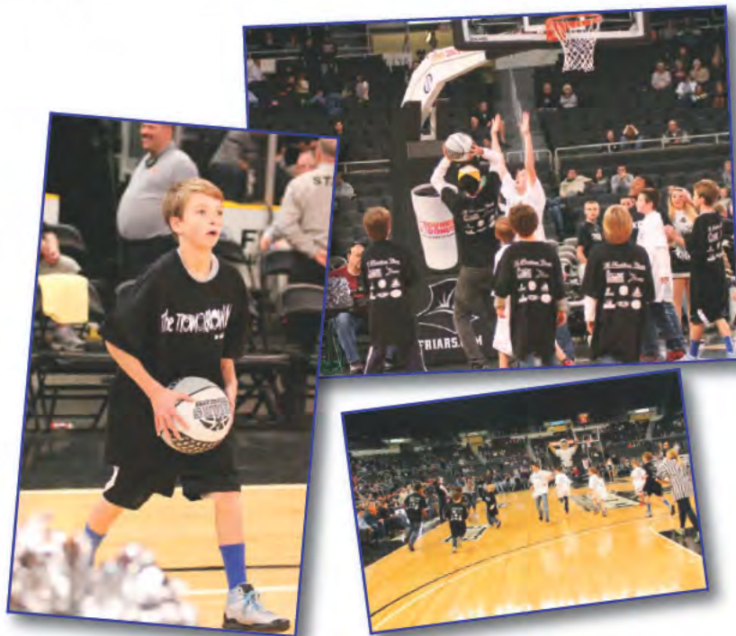
Various shots of TTF Kids and their siblings playing basketball during half-time on the court.