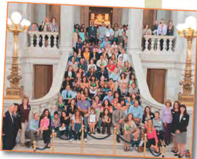
2012 Childhood Cancer Awareness Governor's Reception at the State House